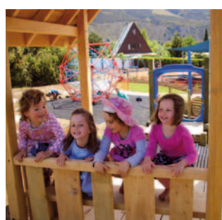
Lake Hawea Community Playground