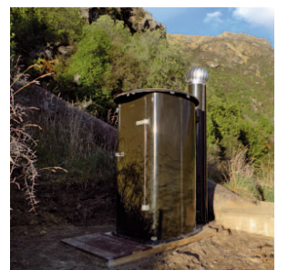
Queenstown Climbing Club "Wilderness Long Drop" public toilet facility in the Wye Creek catchment area