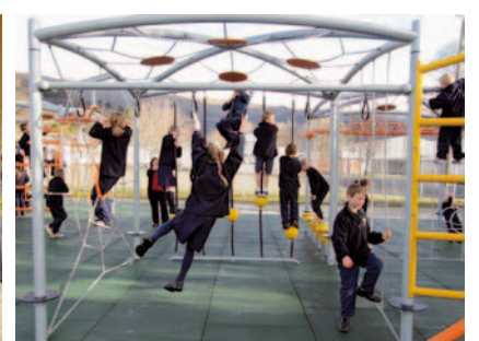
Roxburgh Area School