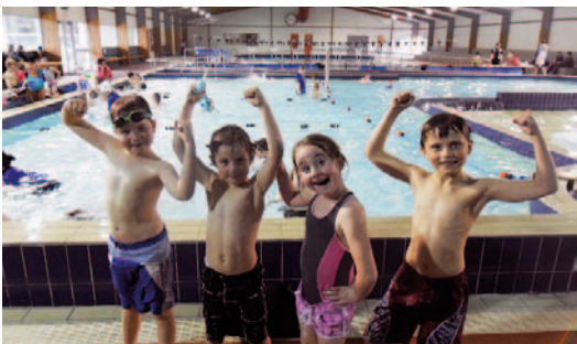
Clyde Primary School children enjoying the Swim Skills programme

This programme aims for the majority of Central Otago children to be able to confidently swim 200 metres, develop associated water survival skills and understand key water safety messages before they leave primary school (Year 8). This initiative will result in reducing the risk of drowning and water related incidences involving children within the area through increased water confidence and fundamental water survival skills.