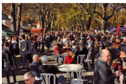
Arrowtown Autumn Festival 2011