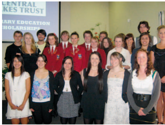
CLT Scholarship Recipients 2010

Central Lakes Trust presented 25 young people (out of 100 applications received) with tertiary scholarships in November 2010. The scholarships, which are valued at $2,000 each, will assist students studying at a tertiary institution in 2011.