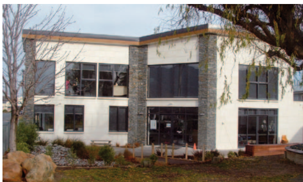
Cromwell Early Learning Centre