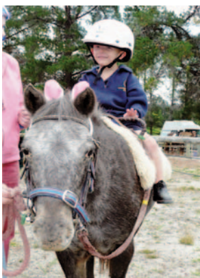
Central Otago Riding for the Disabled