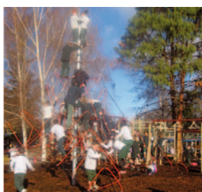
The Terrace School, Alexandra